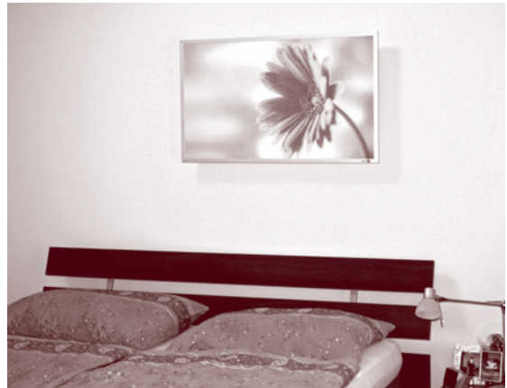
This Redwell heater features a unique design with maximum functionality by working both as a heating source and a piece of art.

Flexible installation (all that is required is a power outlet), low maintenance and product longevity are added perks to the elements' design appeal. A variety of surface colours, picture motifs and mirror surfaces are available to customize the elements.